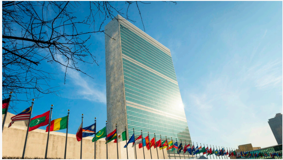
United Nations Headquarters, New York, United States.

Poverty has plummeted to historic lows in South Africa since the launch of Universal Care Income, a nationwide programme turning caregiving and community work into paid jobs. PAGE 25